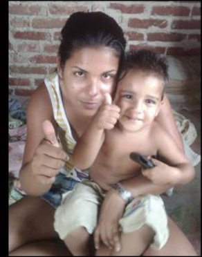
La Negra / Fotografía digital