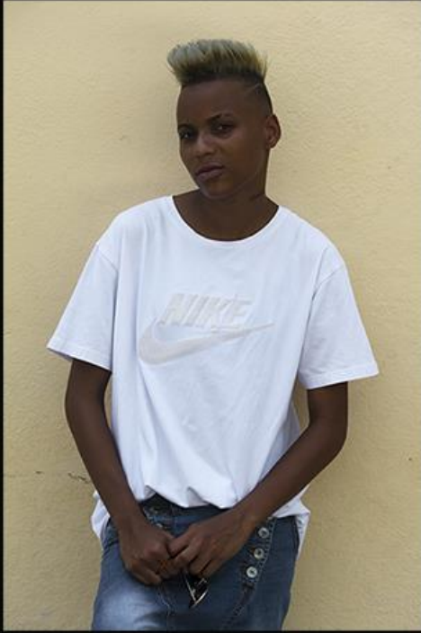
Melanin 20 años, La Habana. Fotografía digital 2019